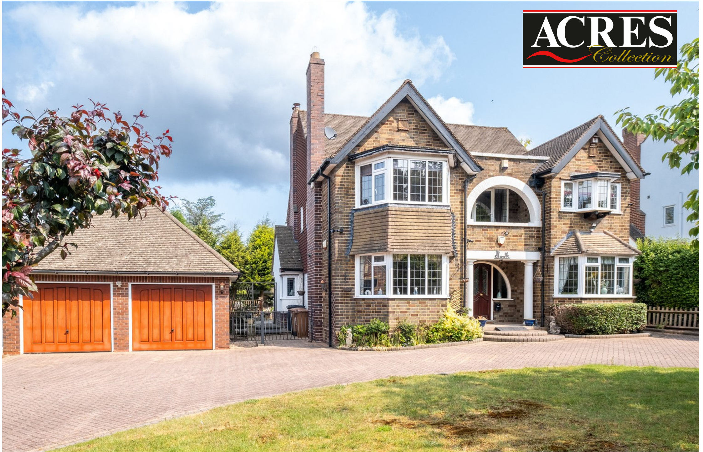
THE SQUIRRELS, TALBOT AVENUE, LITTLE ASTON, B74 3DD